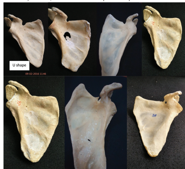
[Table/Fig-3]: Scapula showing different shapes of notches (Top row, from left to right: 'U' shape, 'J' shape, 'V' shape, indentation. Bottom row, from left to right: absence of suprascapular notch, partial ossification of superior transverse scapular ligament, complete ossification of ligament).

Morphometric measurements (vertical length, transverse diameter and distance from base of SN to supraglenoid tubercle) in 'U', 'V' and 'J' shaped scapula are shown in